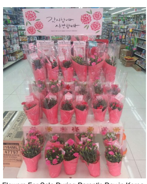
ers For Sale During Parent's Day in Korea

The celebration of Mothers' Day or Parents' Day is truly universal. This special day compels everyone to show appreciation to all mothers whose unconditional love is one of life's most precious gifts.